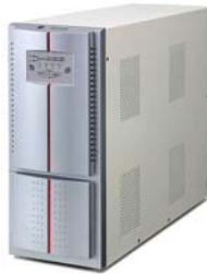
(IPPS shown relative size)

PPI - Instrumentation Power Protection System (IPPS) Specifications: (complete system protection)