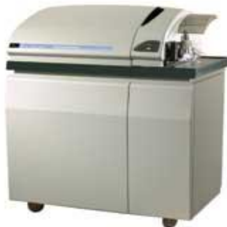
PerkinElmer Elan DRC II ICP-MS (computer workstation not shown) Instrument photo courtesy of PerkinElmer

Design Installations: North America and Countries Utilizing NEMA Type Connectors (120/208 Vac 50/60 Hz)